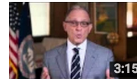
Message from the Chairman by EximBankofUS 170 views