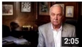
EXIM Testimonial by EximBankofUS 99 views

This section covers how to explain, at a high level, EXIM capabilities and how EXIM products can help small businesses.