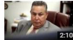
Export Credit Insurance Testimonial DemeTech by EximBankofUS 1,019 views