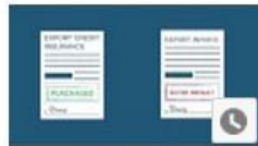
How it Works: Ex-Im Bank Export Credit Insurance by EximBankofUS 1,019 views

Export credit insurance is the most used trade finance product from EXIM. Nonetheless, many U.S. small businesses are still unaware of its availability and many valuable uses. Below are a few resources to catch them up to speed: