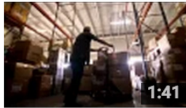
EXIM Overview by EximBankofUS 45 views